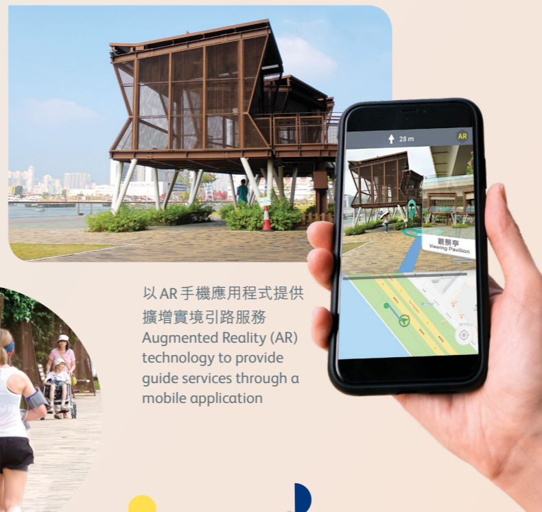
以AR手機應用程式提供擴增實境引路服務 Augmented Reality (AR) technology to provide guide services through a mobile application