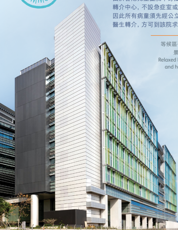
香港兒童醫院臨床服務大樓（B座） Clinical Tower (Tower B) of the Hong Kong Children's Hospital