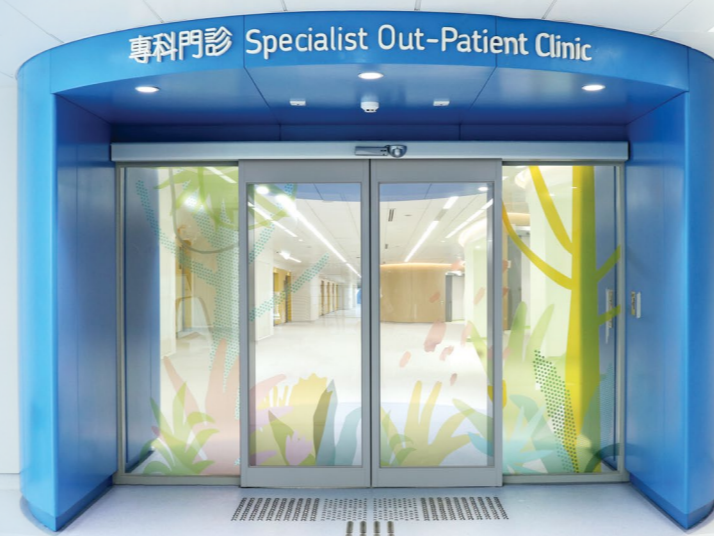
專科門診位於臨床 服務大樓（B座）一樓 The specialist outpatient clinic is located on 1/F of the Clinical Tower (Tower B)

Located at 1 Shing Cheong Road in the Kai Tak Development (KTD), the Hong Kong Children's Hospital (HKCH) has officially commenced service in phases since 18 December 2018, beginning with the specialist outpatient clinic for oncology, nephrology and inborn errors of metabolism, together with radiology, pathology and pharmacy services, in support of patients' treatment needs.